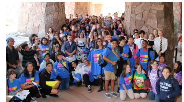
GSA Students attend the Harvey Milk Diversity Breakfast at the Palm Springs Convention Center.