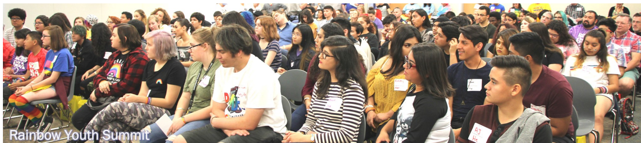
Rainbow Youth Summit